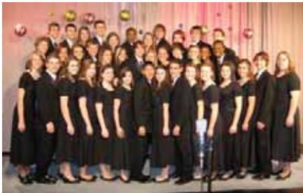
FAME Branson, MO Jefferson City HS Chorale