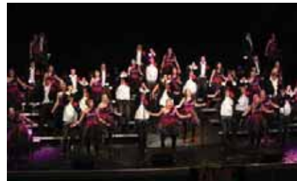
FAME Orlando Show Choir Mitchell HS Friend de Coup