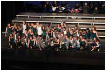
Show Choir America - Washington, DC Onalaska HS Hilltoppers