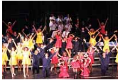
FAME Chicago Show Choir Cup Totino Grace HS Company of Singers