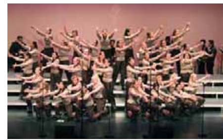
FAME New York Unisex Show Choir Hart High School Hart Breakers