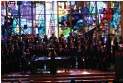
FAME Chicago Concert Choir Classic Horizon HS Towne Criers