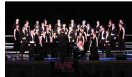
FAME Orlando Concert Choir Center Grove HS CG Singers