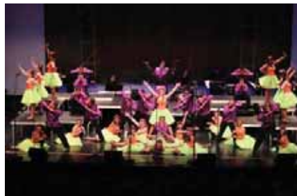
FAME New York Mixed Show Choir Hart High School Sound Vibrations