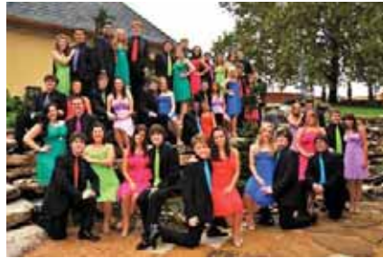
Show Choir Classic - Branson, MO Jenks HS Trojanaires