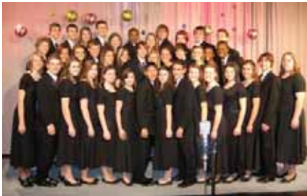
FAME Branson, MO Jefferson City HS Chorale