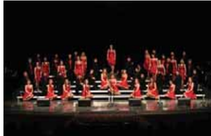
FAME Branson Show Choir Jefferson HS Jefferson Connection