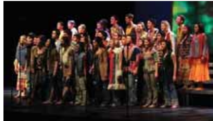
FAME Los Angeles Mixed Show Choir Los Alamitos HS Sound FX