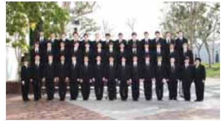
FAME Los Angeles Unisex Show Choir Los Alamitos HS Xtreme