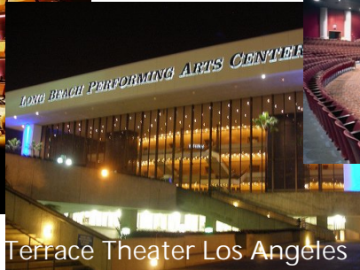
Terrace Theater Los Angeles