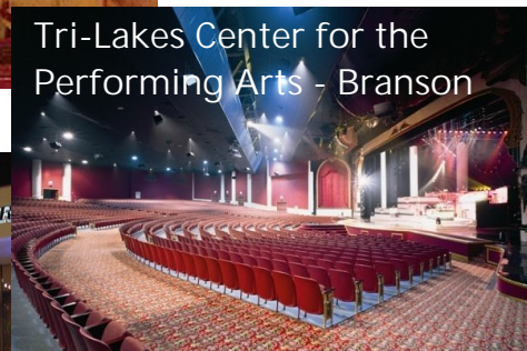
Tri-Lakes Center for the Performing Arts - Branson