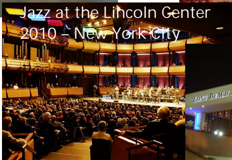
Jazz at the Lincoln Center 2010 – New York City