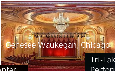
Genesee Waukegan, Chicago